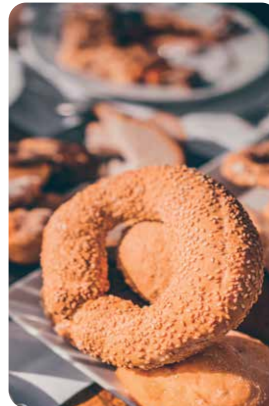
Koulouri, Thessaloniki's traditional snack

Thessaloniki is renowned for its lively nightlife and is the first city of Greece designated by UNESCO as a City of Gastronomy with famous restaurants and many local specialties.