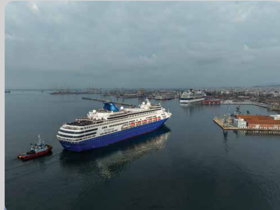
A cruise ship entering the port

15 UNESCO monuments, 30 museums, all within walking distance from the port!