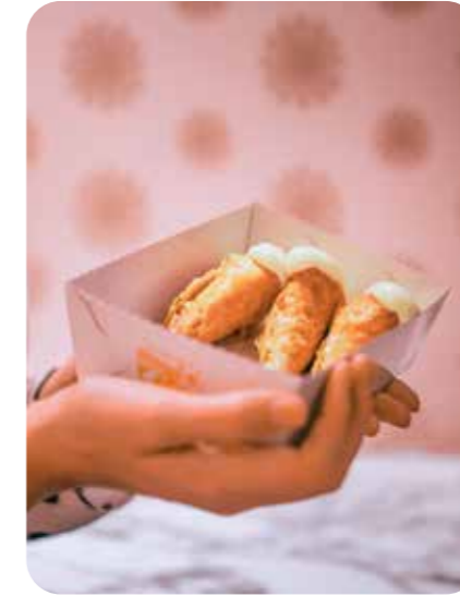
Trigona Panoramatos, a well-known traditional dessert

Greece's first UNESCO city of gastronomy