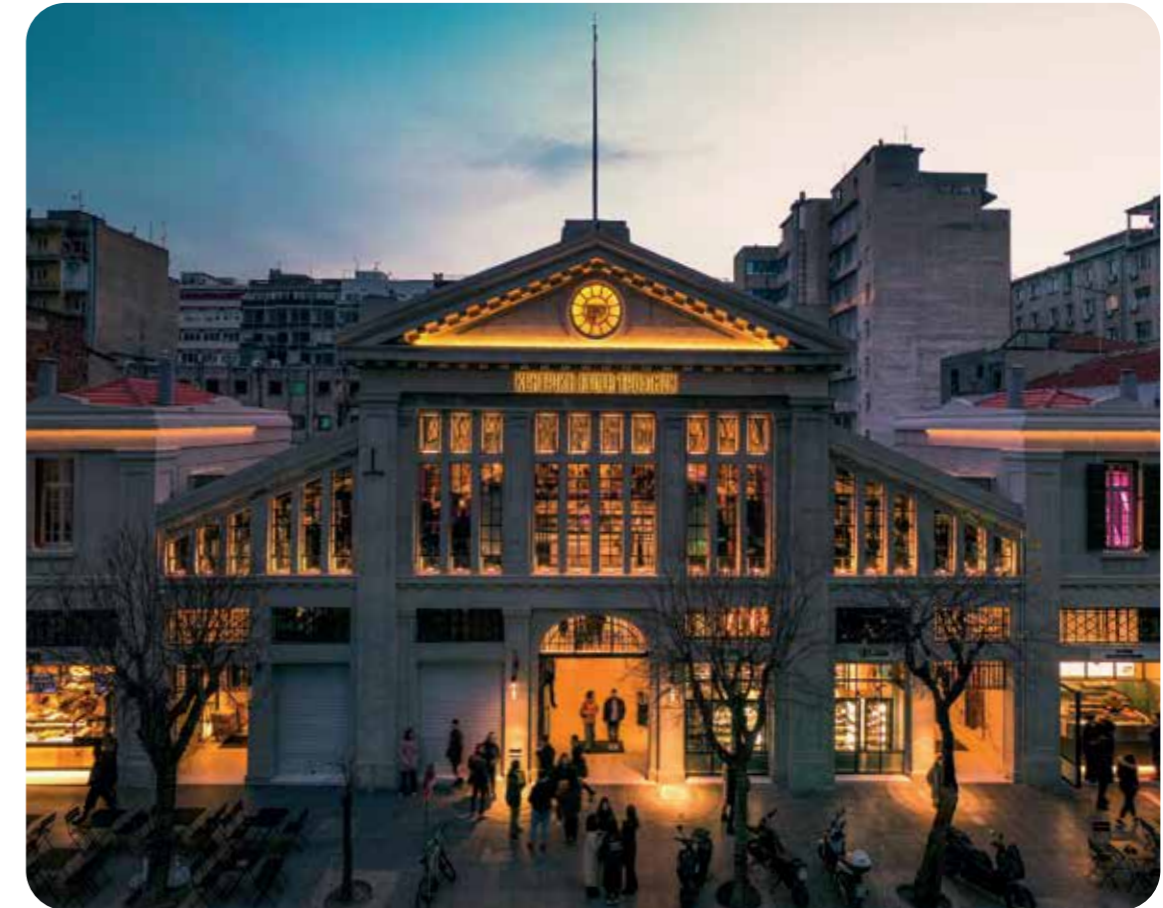
Agora Modiano, Thessaloniki's landmark and Central Food Market refurbished, 100 years after its creation