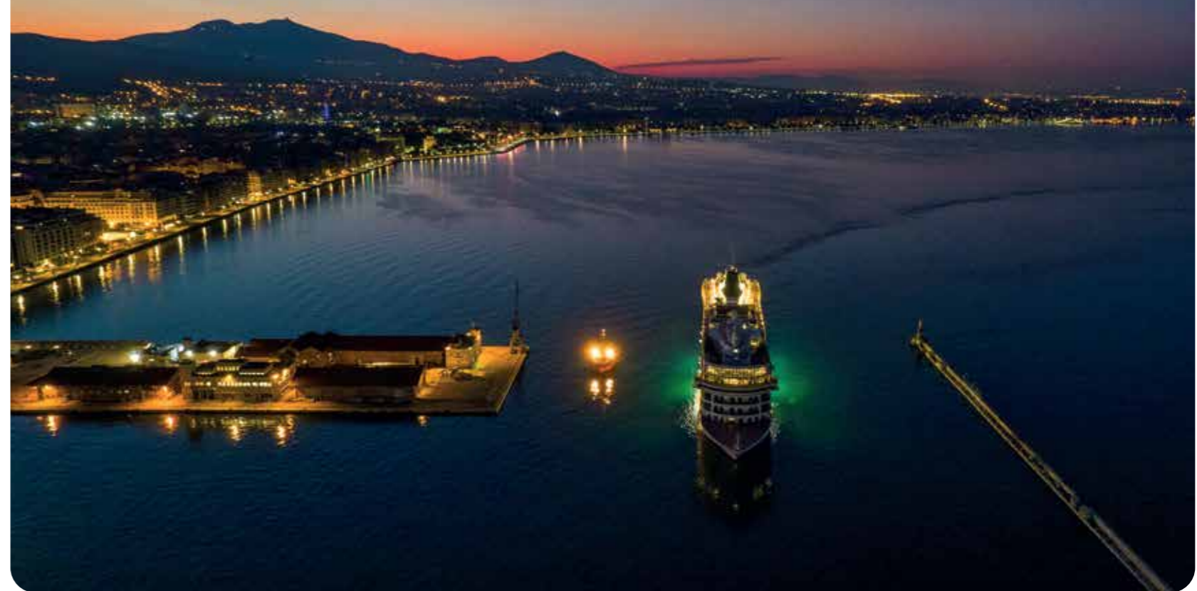
A cruise ship entering the port