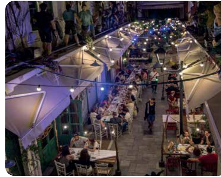
"Stoa Karipi", an arcade full of restaurants and taverns