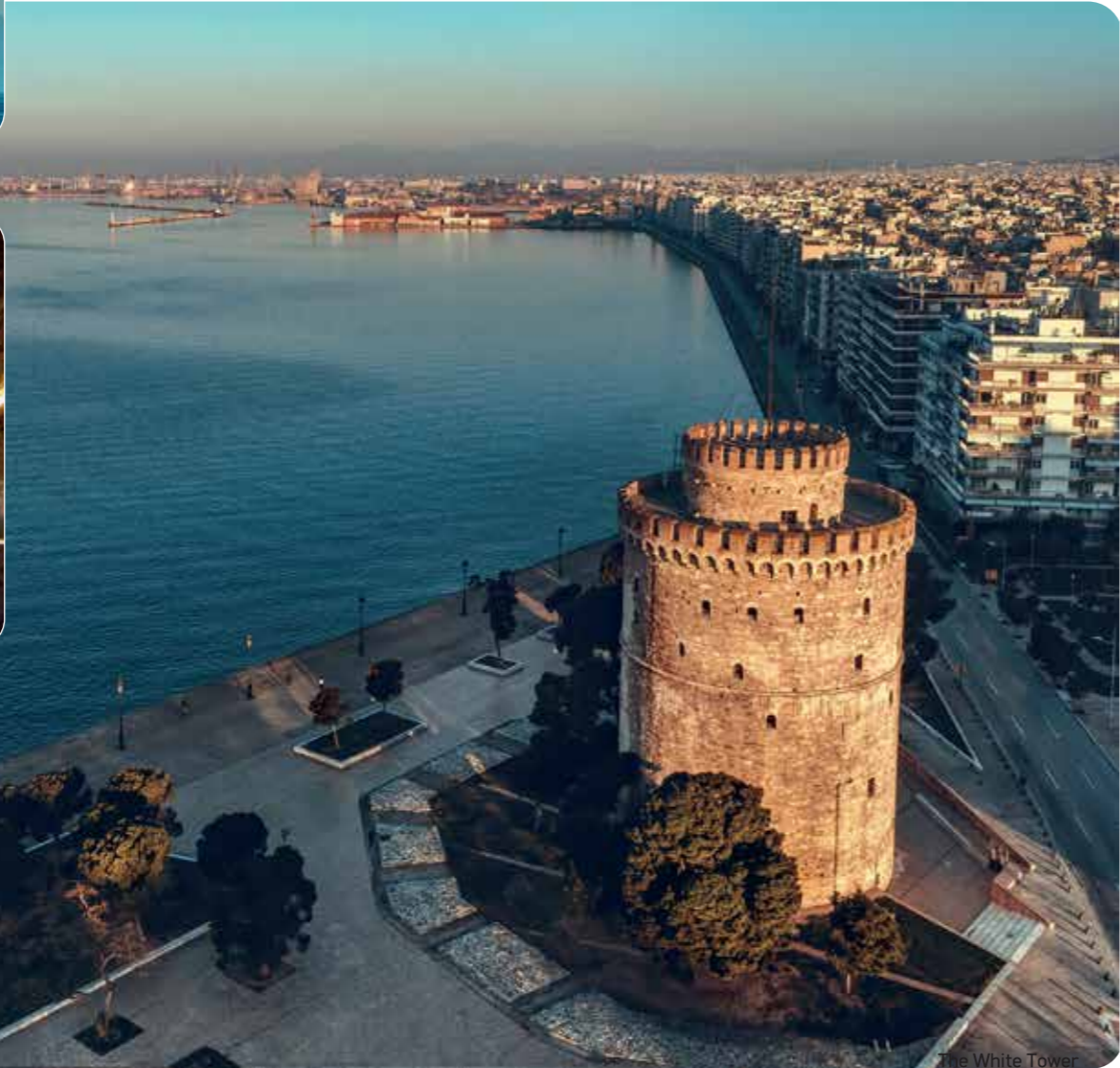
The White Tower