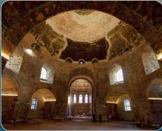
The famous Roman monument Rotunda